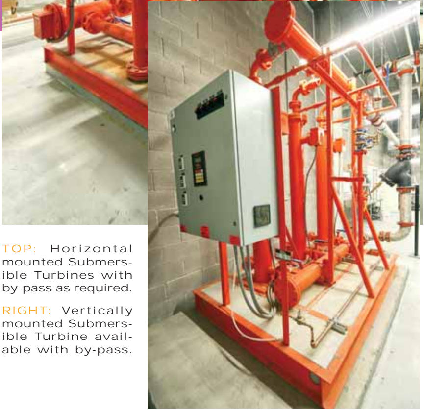
TOP: Horizontal mounted Submersible Turbines with by-pass as required.